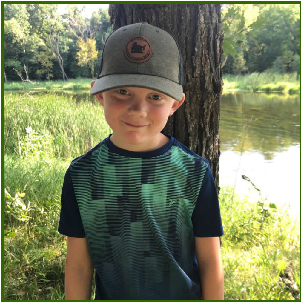
Great kid sporting a Great MPCs Hat!